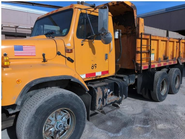
Department of Transportation #3 2001 International #89