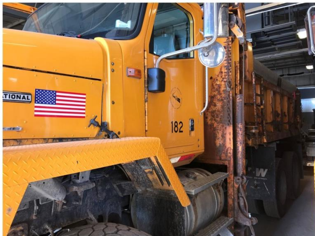
Department of Transportation #5 2001 International #182