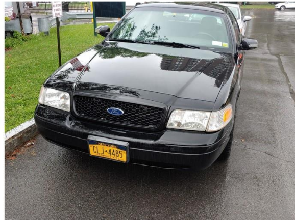
Sheriff's Office #8 2008 Ford Crown Victoria #3033