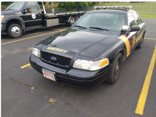
Sheriff's Office #5 2011 Ford Crown Victoria #3171