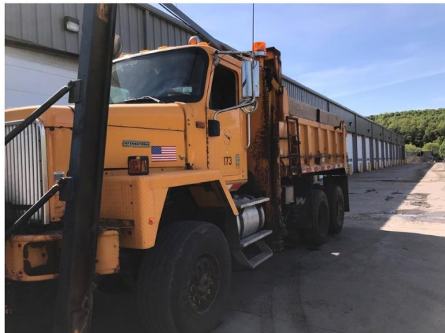
Department of Transportation #6 2001 International #173