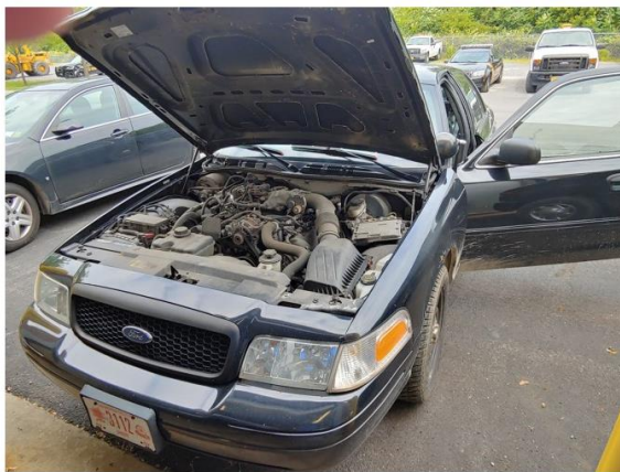
Sheriff's Office #9 2009 Ford Crown Victoria #3112