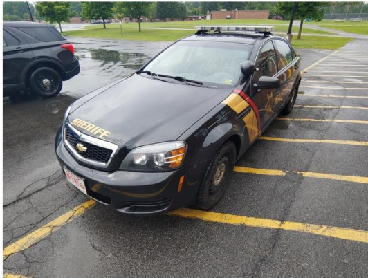
Sheriff's Office #1 2012 Chevrolet Caprice #3187