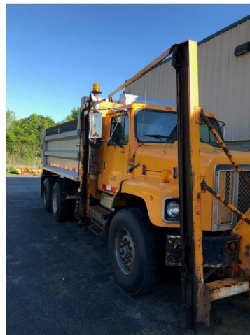
Department of Transportation #8 2002 International #124