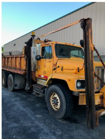
Department of Transportation #7 2002 International #123