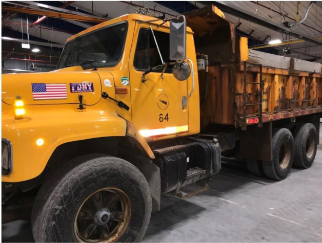
Department of Transportation #1 2001 International #84