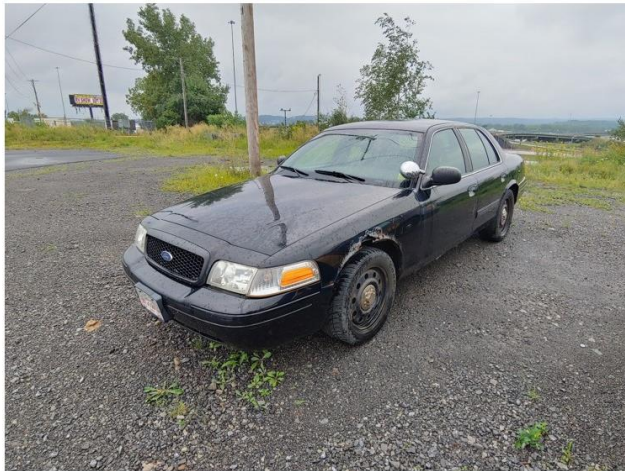
Sheriff's Office #3 2010 Ford Crown Victoria #3130