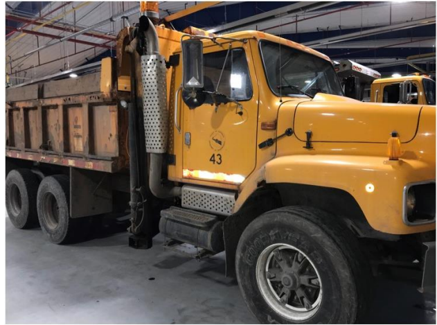
Department of Transportation #2 2001 International #43