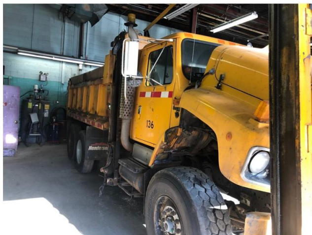
Department of Transportation #9 2002 International #136