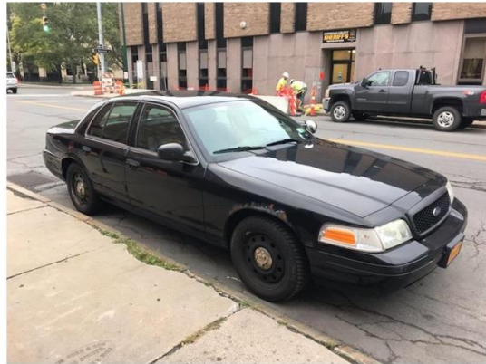
Sheriff's Office #2 2010 Ford Crown Victoria #3149