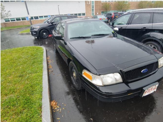
Sheriff's Office #7 2008 Ford Crown Victoria #3024