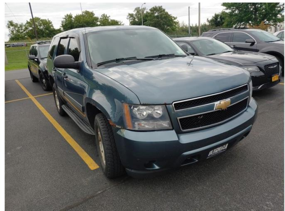
Sheriff's Office #4 2010 Chevrolet Tahoe #3126